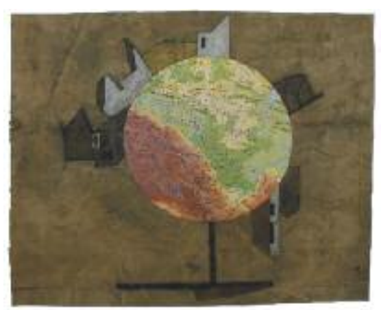
Ghosts 2014, gouache on rice paper 24 × 30cm