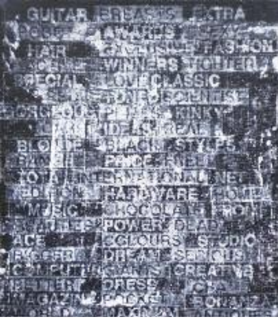
Guitar Breasts 2001, acrylic + oilbar on canvas 35.5 × 30.5 cm