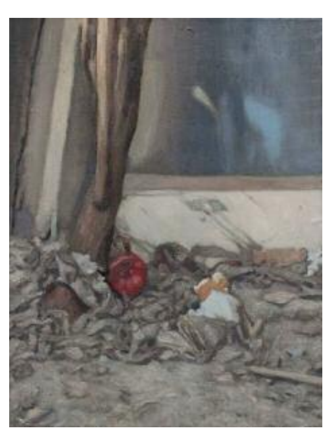
Core 2014, oil & oil pastel on linen 51 x 40 cm